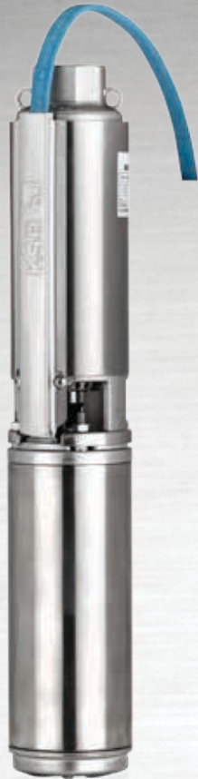
UPAchrom 100CN (60 Hz)